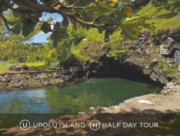
U UPOLU ISLAND H HALF DAY TOUR