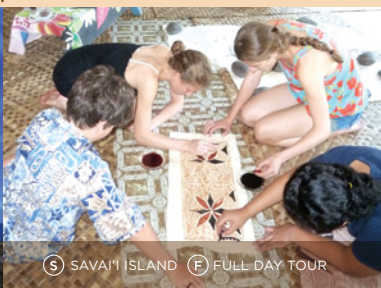
S SAVAI'I ISLAND F FULL DAY TOUR