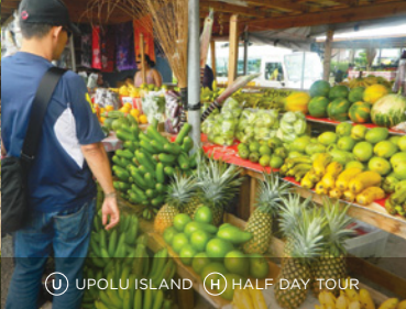
U UPOLU ISLAND H HALF DAY TOUR