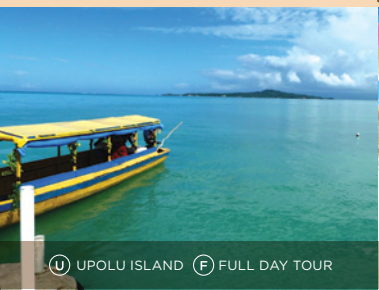
U UPOLU ISLAND F FULL DAY TOUR

Costs include Entry fees, hotel transfers and lunch