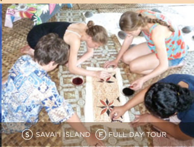
S SAVAI'I ISLAND F FULL DAY TOUR