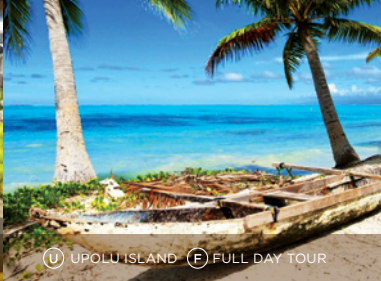
U UPOLU ISLAND F FULL DAY TOUR