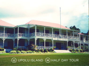
U UPOLU ISLAND H HALF DAY TOUR