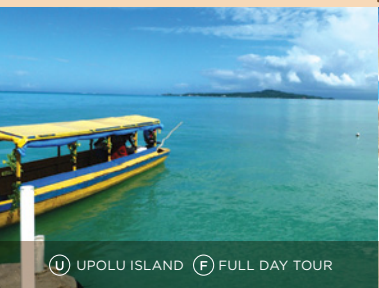
U UPOLU ISLAND F FULL DAY TOUR

Costs include Entry fees, hotel transfers and lunch