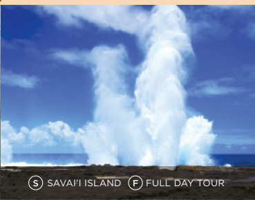
S SAVAI'I ISLAND F FULL DAY TOUR