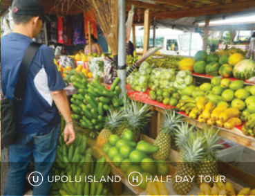
U UPOLU ISLAND H HALF DAY TOUR