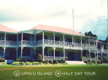
U UPOLU ISLAND H HALF DAY TOUR