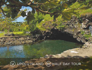
U UPOLU ISLAND H HALF DAY TOUR