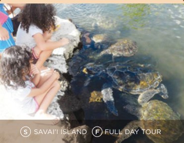
S SAVAI'I ISLAND F FULL DAY TOUR