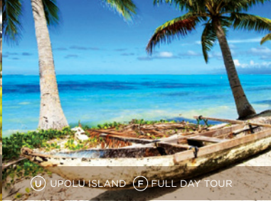
U UPOLU ISLAND F FULL DAY TOUR