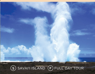
S SAVAI'I ISLAND F FULL DAY TOUR